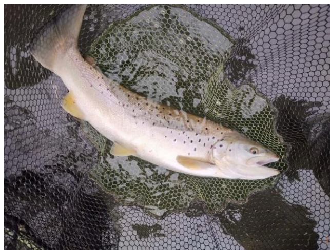
Jeff Hurst landed a stunning 5lb+ Brown Trout. Caught on a floating line using a small black tinsel booby on Blagdon.